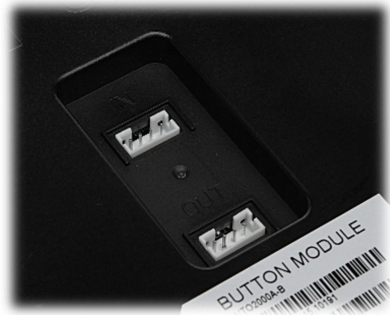
Example of application: